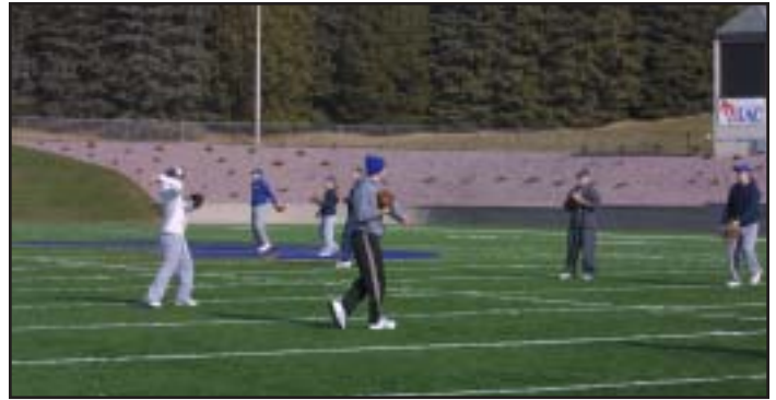
The Pioneers took advantage of the unseasonable January weather to work outside at Ralph E. Davis Pioneer Stadium.

The early start was done by design. Instead of one long trip over spring break in March, the Pioneers will play three weekend